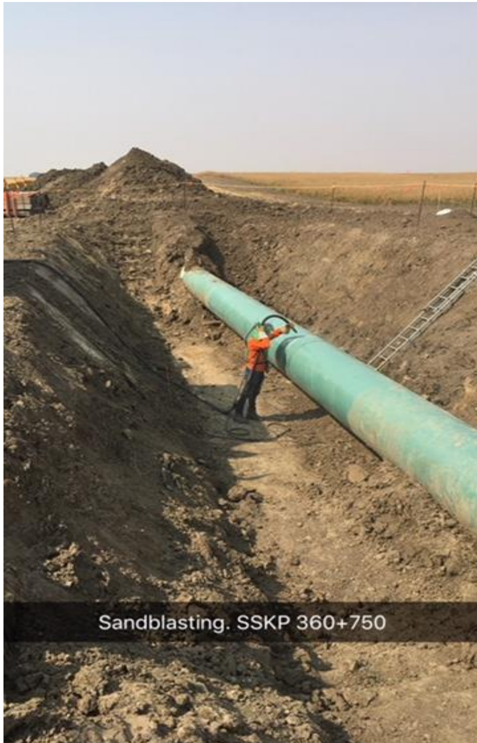
Sandblasting. SSKP 360+750