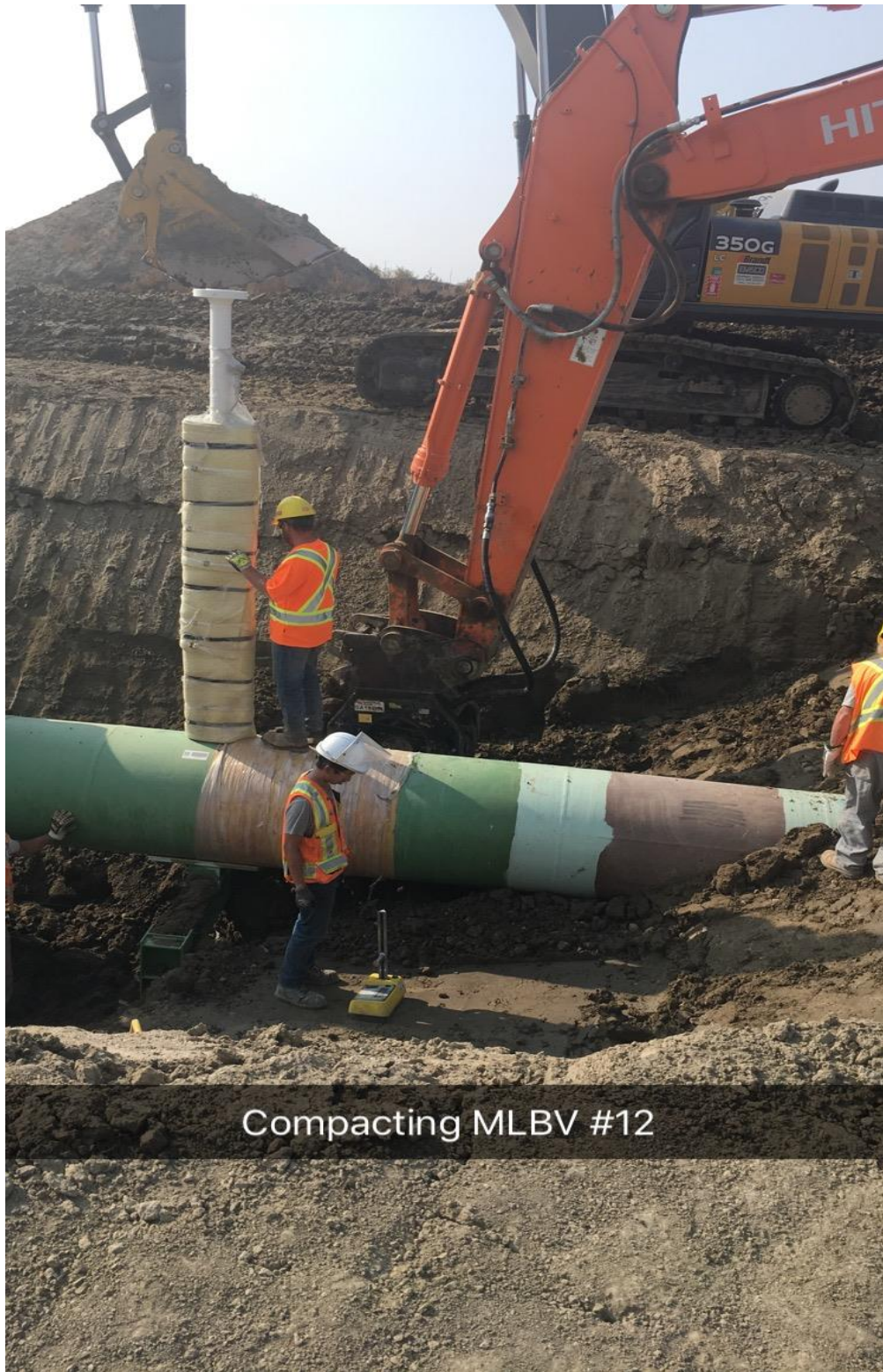
Compacting MLBV #12