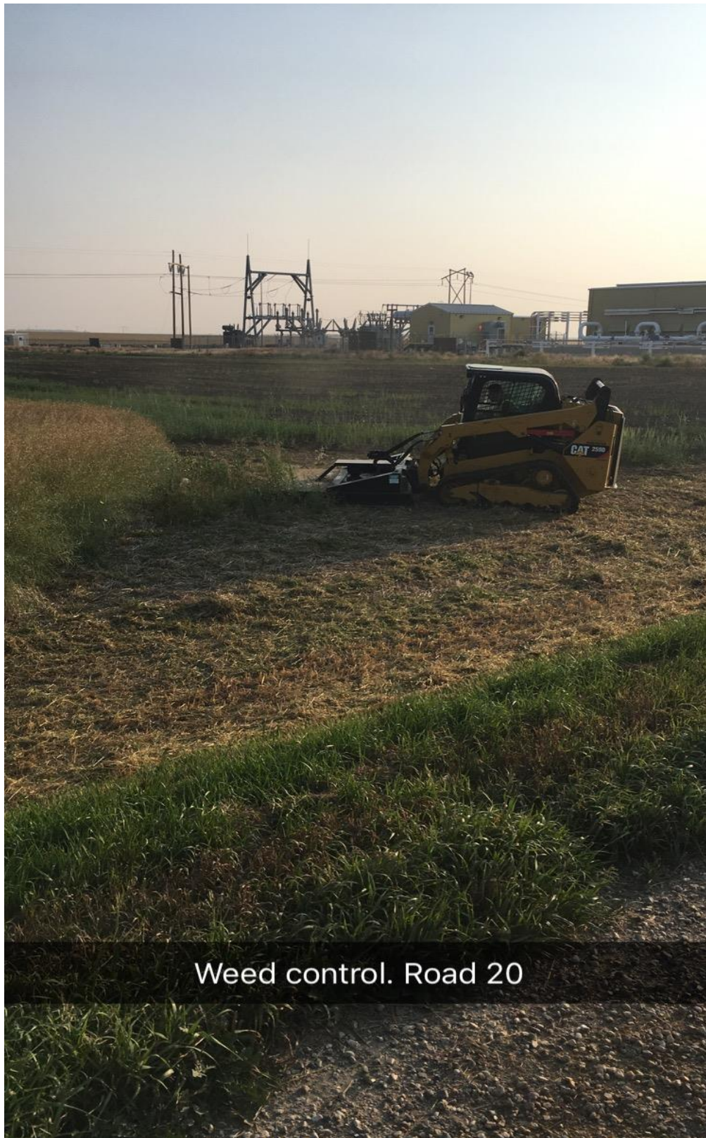
Weed control. Road 20