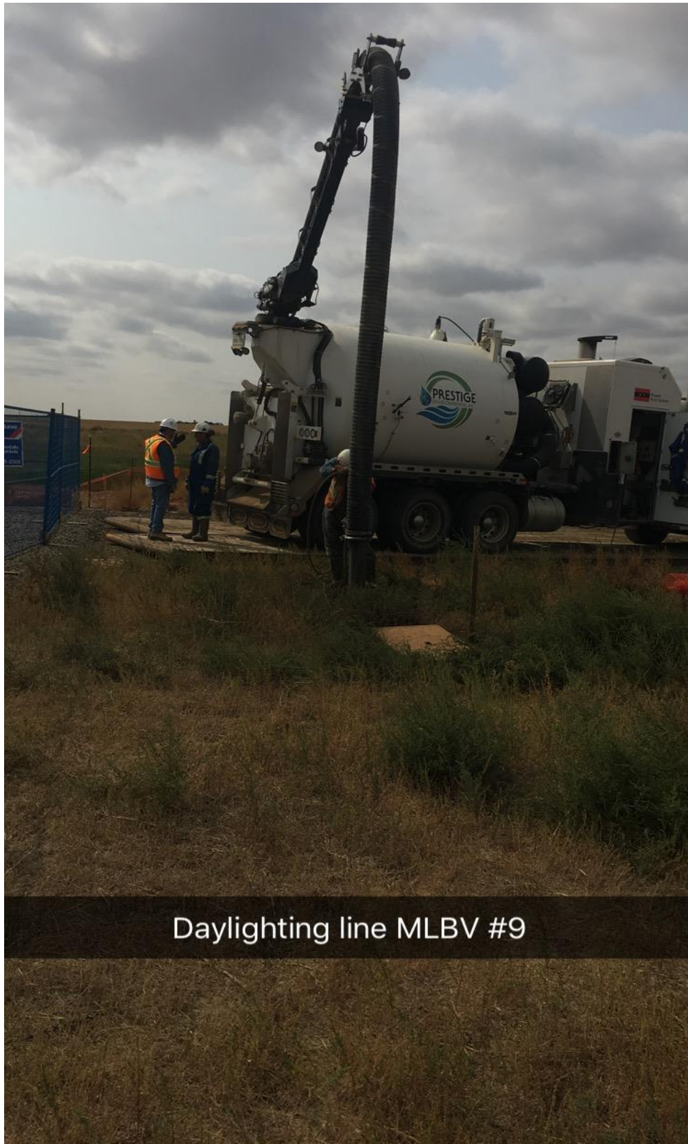
Daylighting line MLBV #9