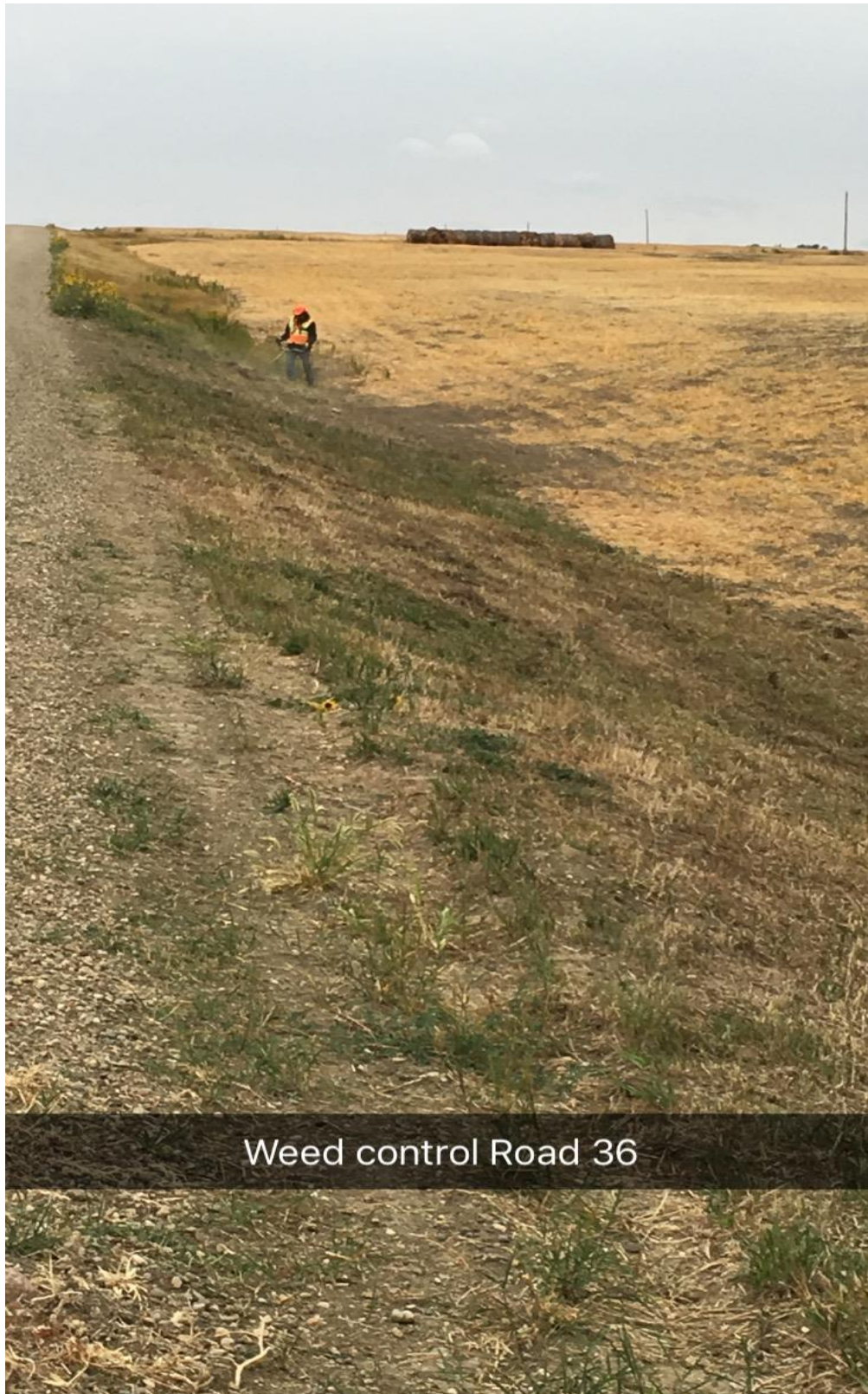
Weed control Road 36