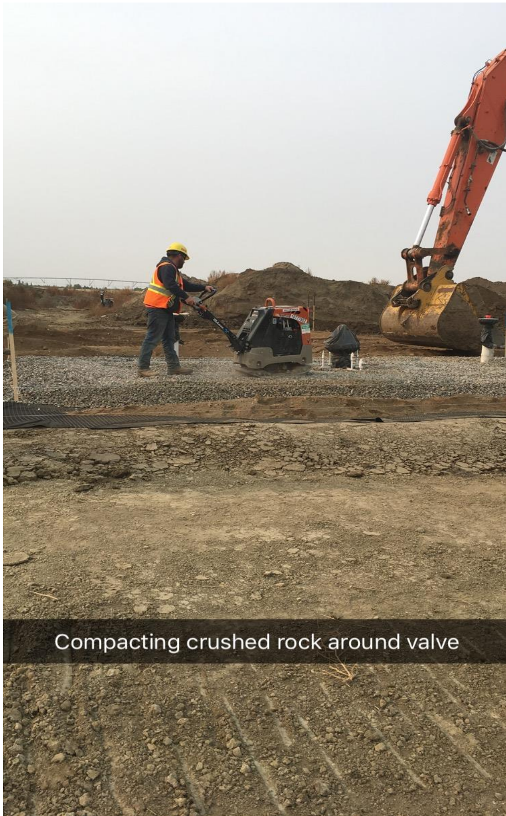
Compacting crushed rock around valve