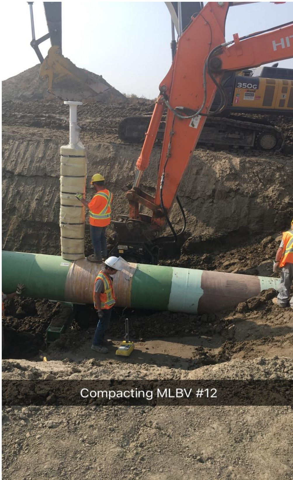
Compacting MLBV #12