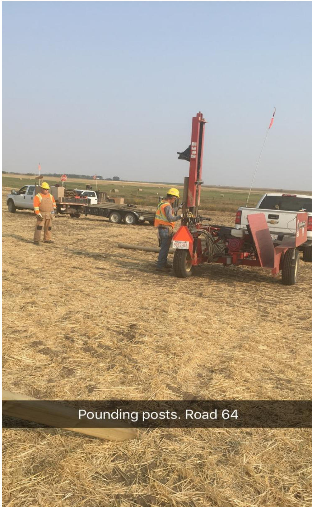
Pounding posts. Road 64